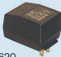
SKK-620 (USA only)